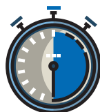
Ensure Timely Movement of Components