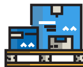
Monitor Environmental Parameters in Storage