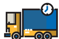
Track and Monitor Goods in Transit