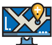
Indoor Asset Location

The placement of reference points drives the accuracy of location. In areas where the exact location is needed, more references points can be placed. Where zone level accuracy is sufficient, even less infrastructure is required.